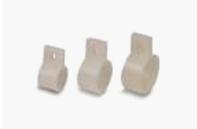
NYLON COLLAR BRACKET