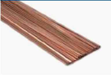
COPPER PHOSPHORUS BRAZING ALLOY (BCuP-2)