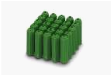
PVC WALL PLUG