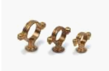
BRASS URINAL BRACKET *