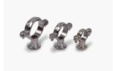
BRASS URINAL BRACKET (CP) *