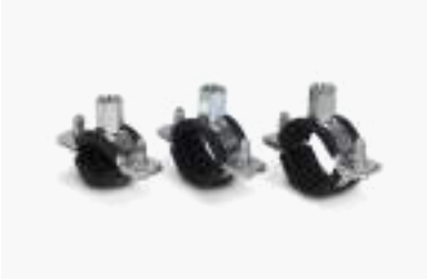
G.I. COPPER PIPE CLIP *