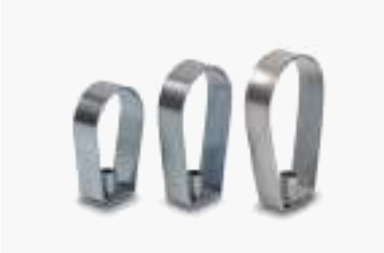
G.I. LOOP HANGER *