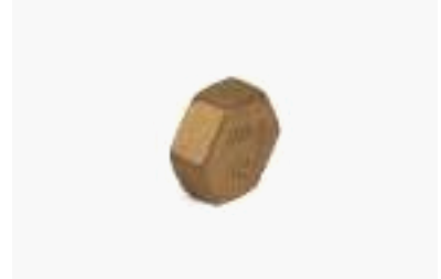
FEMALE END CAP