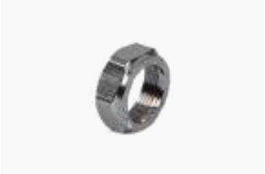
COMPRESSION NUT (CP)