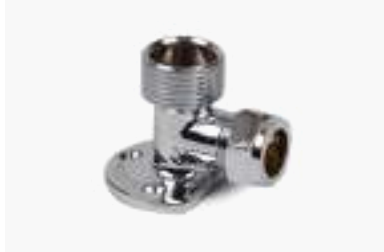
CXMI FLANGE ELBOW (CP)