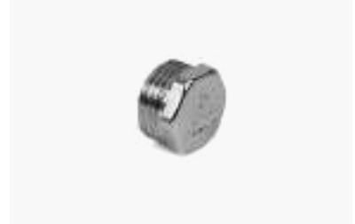
MALE PLUG (CP)