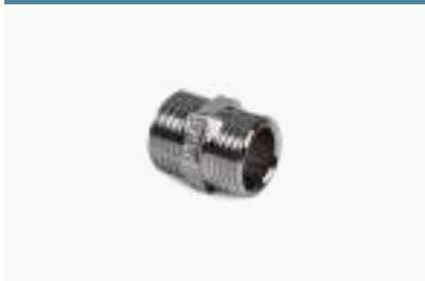
MIXMI NIPPLE (CP)