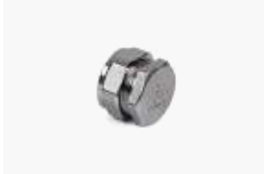
COMPRESSION STOP END (CP)