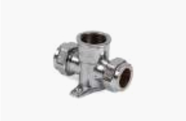
CXCXFI FLANGE TEE (CP)