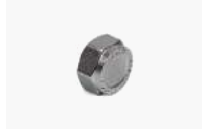
FEMALE END CAP (CP)