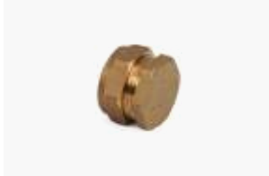
COMPRESSION STOP END