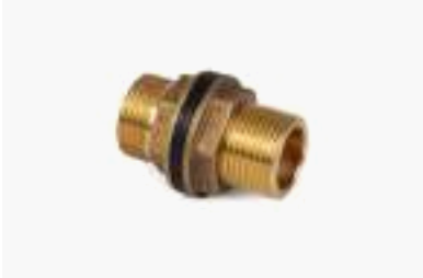
MIXMI TANK CONNECTOR