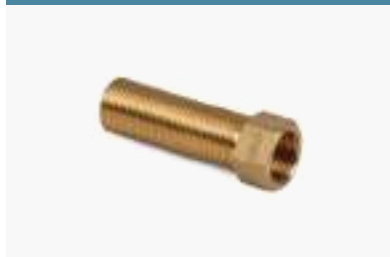
MIXFI EXTENSION PIECE