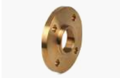
FLANGE PN16 FEMALE THREAD