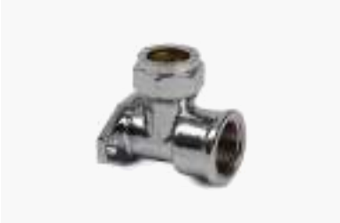
CXFI FLANGE ELBOW (CP)