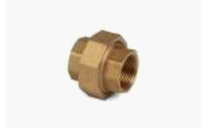
FIXFI UNION FLAT SEAT