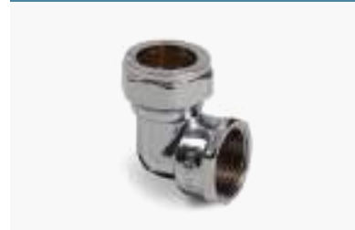
CXFI ELBOW (CP)