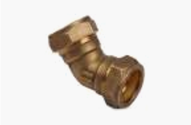
45DEG CXC ELBOW