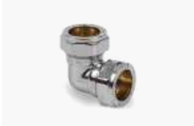
CXC ELBOW (CP)