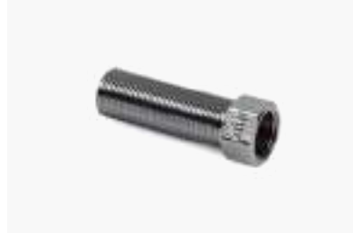
MIXFI EXTENSION PIECE (CP)