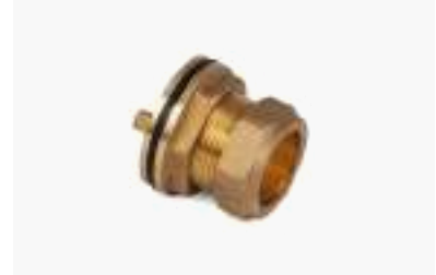
CXC TANK CONNECTOR