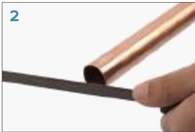
2 Remove any burr from the inside and outside of the tube ends using a fine toothed file. (Fig. 2)