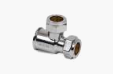
CXFIXC TEE (CP)