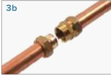
3a There are two methods of assembling a compression joint.