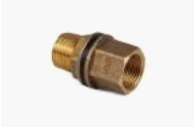
MIXFI TANK CONNECTOR