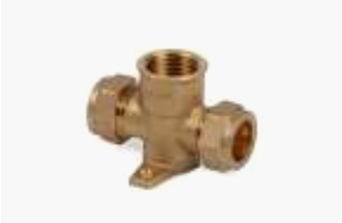
CXCXFI FLANGE TEE