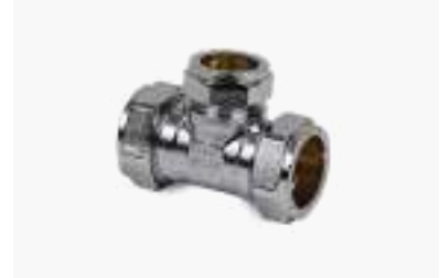
CXCXC TEE (CP)