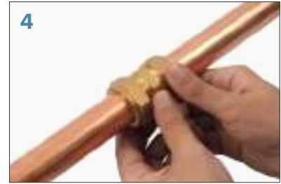
4 Tighten the nut using your fingers until tight. (Fig. 4)