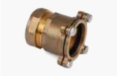
FLANGE CONNECTOR (C.I PIPE)