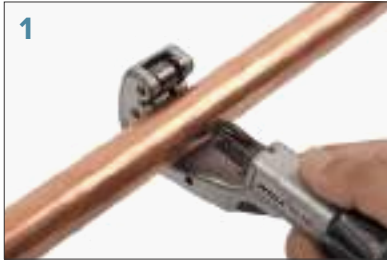
1 Cut the tube square using a rotary tube cutter. (Fig. 1)

Select the correct size of tube and fitting for the job. Ensure that both are clean, in good condition and free from damage and imperfections. If the tube is oval or damaged, use re-rounding tool.