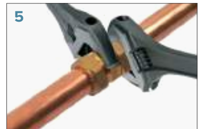
5 Tighten the compression nut further using spanners; a second spanner must be used to prevent the fitting from rotating. (Fig. 5)

Refer to Table 2 for the correct number of turns to make the joint.