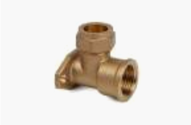
CXFI FLANGE ELBOW